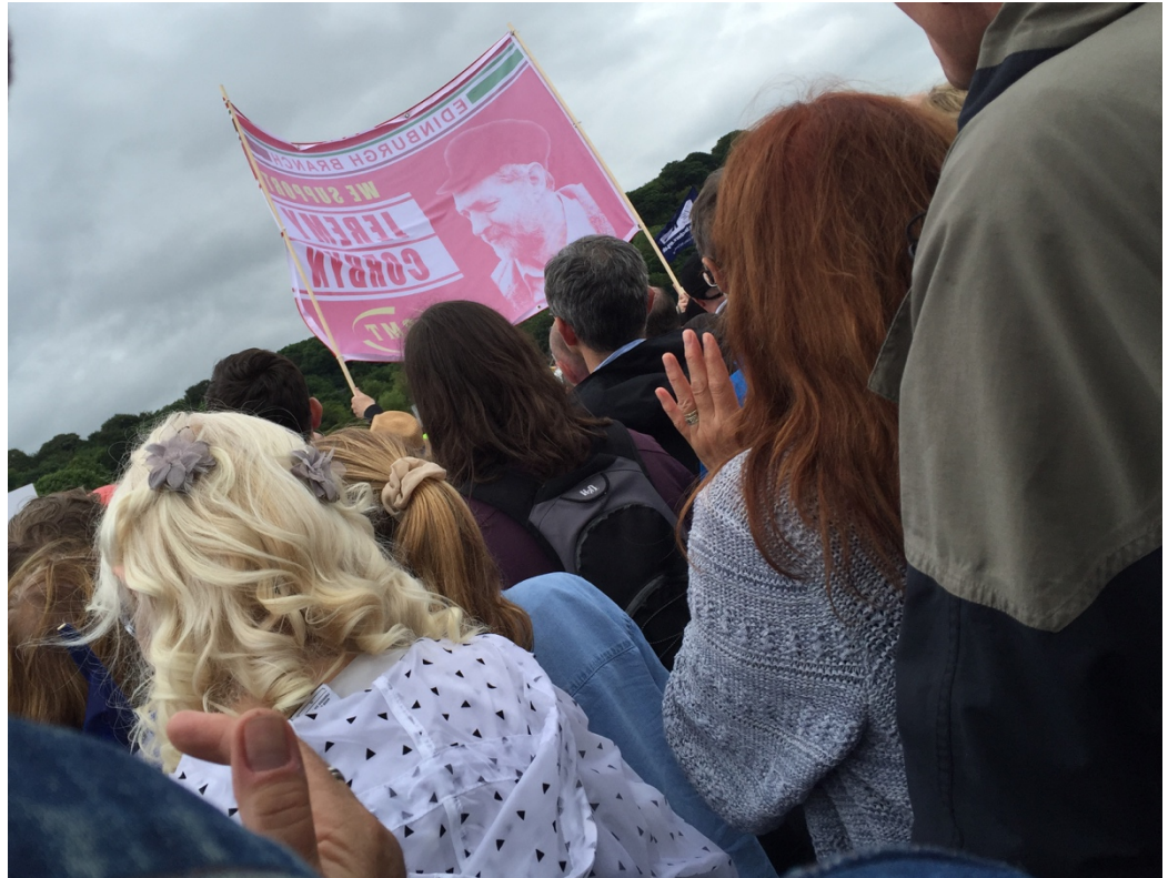
The Big Meeting, Durham Miners' Gala, July 2017.

I end by recounting an anecdote from my own field notes regarding a mass event of political performativity drawn from lived experience. This not only engages with the boundlessness of the human condition to be-with , it illustrates a range of elements discussed in this paper: the Durham Miners' Gala may have a superficial semblance of structure, dominated by the organized structures of the trade union and labour movement, but it is saturated with affective carnival, a subordinate disorderly unruly politics, and spontaneous performative utterances.