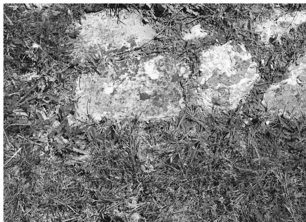
Figure 5: Mountain View Cemetery, Vancouver.

It is also difficult to follow their movements by relying on official documents because they lived and worked in the underground economy. They usually had nicknames, sometimes more than one, and changed them according to the situation. Some women used forged passports. In general, official archives do not tell us much about the lives and deaths of "Oriental" women. When they do, those documents are erroneous, negligent, and above all, racist. On their death registrations, for example, these women's names are spelled wrong, the last and first names are reversed, sections are often left blank, and their religious denomination can simply be "Jap."