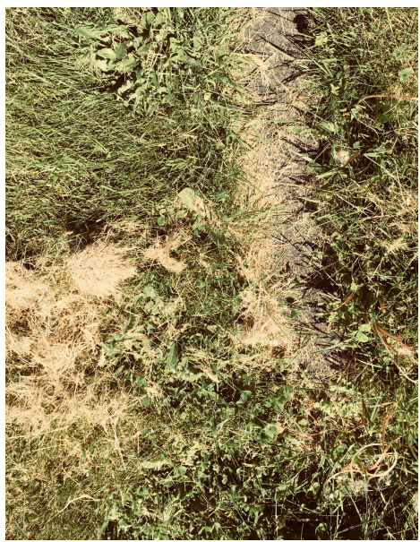
Figure 4: Mountain View Cemetery, Vancouver.

In her essay entitled "Future Future," Flora Pitrolo (2015) reflects on archives of performance and discusses the impossibility for them to fulfill their mission as what Jacques Derrida calls "house arrest." From the institutional point of view, the archive ought to be a permanent dwelling place for historical documents, in which they are systematically classified and filed, physically secured and guarded. The archive also bestows the meaning of the documents "in privilege" and renders their initially private secrets public and nonsecret (Derrida 1995, 10). However, archives of performance, Pitrolo writes, "thrive on the very unavailability of the material they are meant to safeguard" (para. 3), because performance consists fundamentally of movements and their disappearance. Performative moments are often found in "bodies, gestures, glances, sighs" that are impossible to arrest. In these archives, therefore, "absence is particularly present" (Pitrolo 2015, para. 2). Instead of showing us