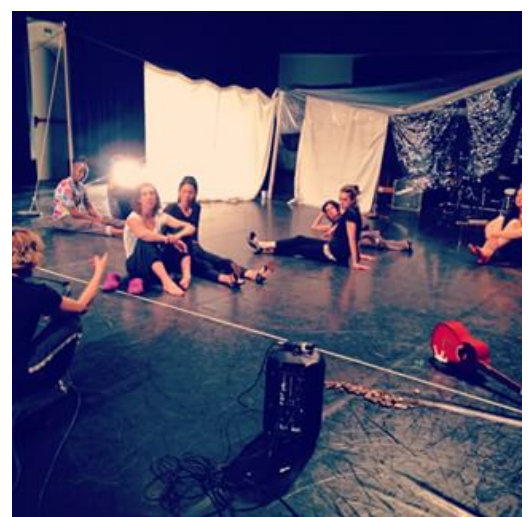
Image of creative process for We Women. Copyright David Ruano. Reproduced by permission of Sol Picó Cia de Danza.

Set on a sand-covered stage, occupied by an improvised encampment that evoked the nomadic, the refugee and also the ephemeral community spaces constructed in public squares by the 15-M protest movement (known in Catalonia as the Indignats ) against government corruption and elite mishandling of the financial crisis,<sup>26</sup> the performers first entered the stage as individual women—their bodies exposed, semi-naked and vulnerable in heels—and posed under a sand shower, defiant and proud, before performing their individual performance styles. This vulnerability was reprised as