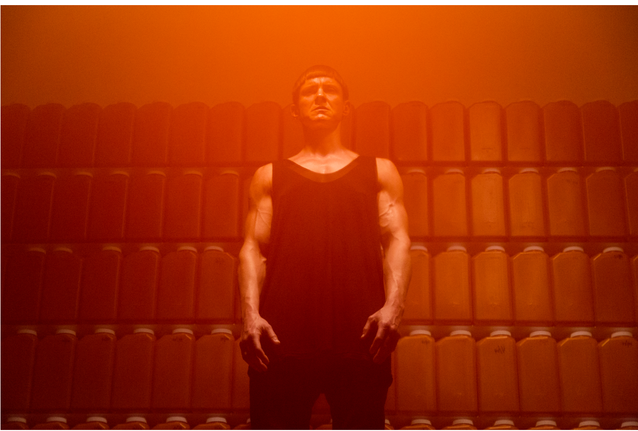
Cassils, Fountain , 2017. Performance still from Cassils's closing action of 200-day durational performance, PISSED .