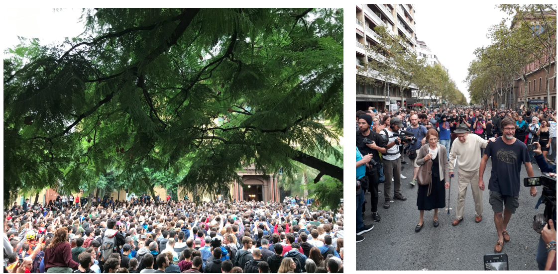
Voters at the Escola Industrial in Barcelona after hearing rumours that the police were about to arrive.