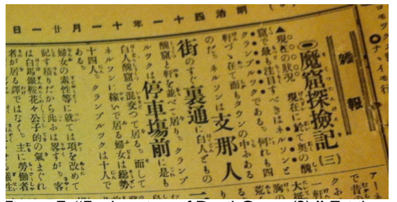
Figure 7: "Exploration of Devil Caves (3)," Tairiku Nippo , November 21, 1908, p.5.

Currently, the interior caves that most deserve our attention include Nelson and Cranbrook. Each has four caves, and they are located inside the town. Nelson has them stand side by side with white caves on the backstreet of Chinatown; Cranbrook has them also mixed with white caves in front of the CPR station. In total of 14 women work in Nelson, and 10 in Cranbrook. (Shohei Osada, "Exploration of Devil Caves," 21 November 1908)