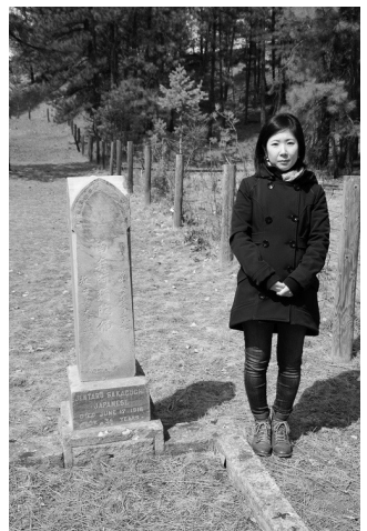
Figure I: Cranbrook Old General Cemetery.

What follows is an account of my performance ethnography on an elusive history of Japanese migrant women involved in the transpacific sex trade at the turn of the twentieth century. While this is a single-authored paper, it is inspired by works of a number of women who have engaged this history in the past and guided my journey. They include Japanese women writers from the late 1970s through the early 1990s, including Yoko Yamazaki (1972, 1974, 1981) and Miyoko Kudo (1989, 1991), who excavated stories of Japanese migrant sex workers abroad. This involved archival and fieldwork research, and travels across the Pacific, visiting cemeteries, looking for their graves, and praying for their spirits. The picture on the left, which includes myself standing by a headstone that belongs to a Japanese migrant, echoes a photograph of Kudo captured exactly at the same location in the Cranbrook Old General Cemetery during her research in Cranbrook, British Columbia.<sup>1</sup> This image also implicitly makes a reference to a photograph of Yamazaki at a cemetery in California,