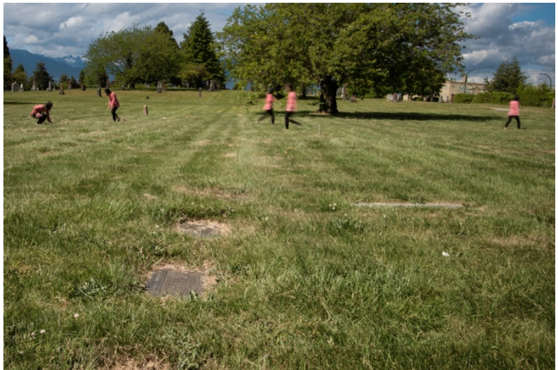
Figure 13: Mountain View Cemetery, Vancouver.