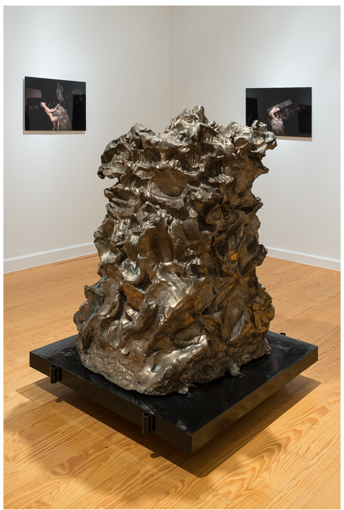
Cassils, Resilience of the 20%, 2016. Bronze cast of clay from a Becoming an Image performance. Bronze Sculpture: 1,300 lb. Steel Plinths: 900 lb.