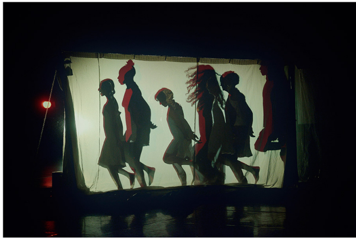
The performers mimic Shantala's performance style.

a collective moments later, with them re-entering the arena slug-like, rolled in sleeping bags, before slowly emerging to their new community as if from chrysalises, all of them wearing shiny shell-suits. Together in this new encampment on stage, the women tried out different ways of being together, whether through social processes of more or less violent subjectification such as the performance of a lapidation, a hyper-competitive aerobics class, and fighting over an apple, or through sharing individual stories of childhood (often moving between different languages) and social narratives of the treatment of women in their respective societies. Some of these stories were then translated into song or dance, before being mimicked by the others, either copying the style of the original or translating it to different performance languages: trance-like tribal African, Japanese butoh, Asian kuchipudi, flamenco, including Picó's own brand of impossible en-pointe zapateado (the often breathlessly rapid, percussive footwork characteristic of flamenco dancing).