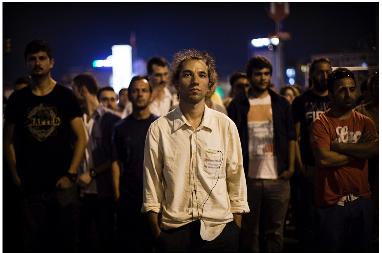
Erdem Gündüz, Duran Adam , protest performance, Taksim Square, Istanbul, 2013. With kind permission of Erdem Gündüz and Italo Rondinella. Photograph © Italo Rondinella, 2013. <u>www.italorondinella.com</u>

Before moving on to consider the ontology of beings-in-common and querying the nature of the political unity which is produced, I want to highlight one of the most powerful single performative acts of recent times which engaged with histories and currencies of passive political protest: the Turkish choreographer Erdem Gündüz's lone eight-hour Standing Man protest on June 18, 2013, in Taksim Square, Istanbul.<sup>21</sup> Following the brutal suppression of the mass protests that had taken place through May and June in Gezi Park, Gündüz stood motionless, staring at the giant portrait of Mustafa Kemal Atatürk, the founder of the Turkish Republic, a figure admired by the protestors. Initially ignored, he was joined throughout the day by thousands of anti-government protestors in this defiant act of silence in the Square, facing the Atatürk Kültür Merkezi cultural centre, a building due to be demolished under the president's plans to redevelop the Gezi Park area. In this context, the seemingly innocuous act of staring amounted to a political act of dissent.<sup>22</sup> Such a dignified act resonated not only with indigenous cultures of spiritual and religious practices within the region but also with Western genealogies of performance art as endurance. Notably, when interviewed about the event, Gündüz claimed the act as a protest, while emphasizing that the artistic aspect is precisely what made the political statement even possible.