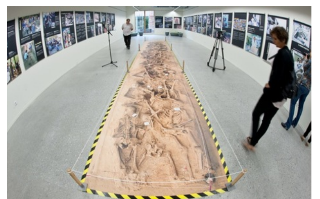
Exhibition on the excavation of mass graves in Spain for display in the European Parliament.

Raul Romeva headed the secessionist Junts pel Sí (Together for Yes) list in the 2015 regional elections, but had formerly served as an MEP for Catalonia's Green Socialist Party, Iniciativa per Catalunya Verds, with a long history of commitment to action on international Human Rights, conflict resolution and peace activism that included lobbying for European recognition of mass graves from the Franco period in Spain.