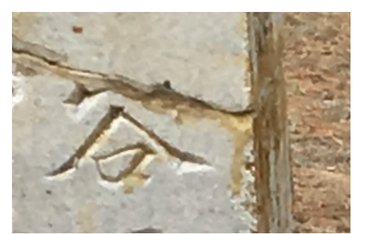
Figure 9: Grave #2, Cranbrook, BC.

Some headstones have additional inscriptions that indicate the date of death, the age at death and even the hometown of the deceased. The Japanese inscription of this grave reads, "The grave of Toku Iketani." Below, the English inscription reads, "Native of Wakayamaken, Japan; Aged 32 Yrs; Died 16 Dec. 1909."