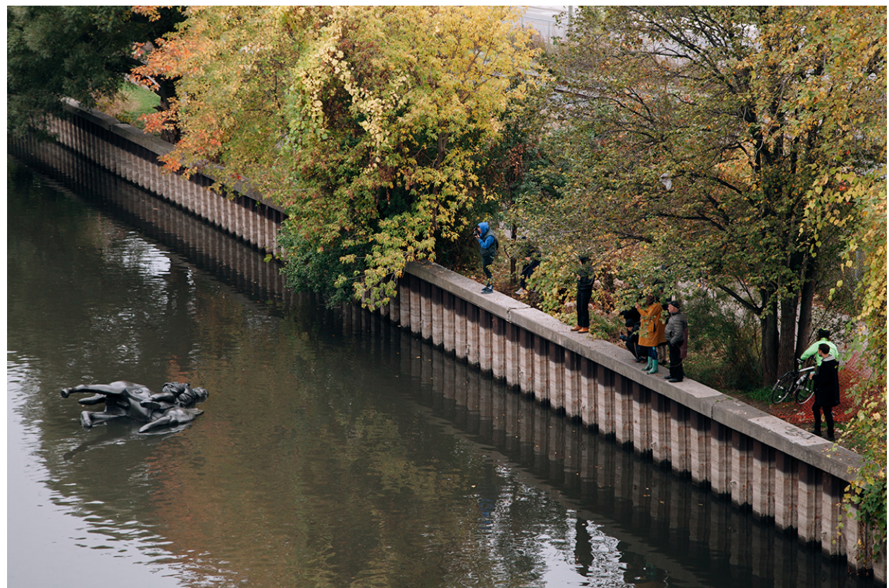
Life of a Craphead, King Edward VII Equestrian Statue Floating Down the Don River (2017).

Through their performance action, Life of a Craphead literally (and metaphorically) floated a symbolic colonial relic down Toronto's Don River while viewers watched a performed version of history drift away (and at times outright sink). The performance art pair created a life-sized replica of a real King Edward VII equestrian statue that is currently situated in Toronto's Queen's Park, pulled it upstream by kayak, and floated it back down. This anti-monument performance series, lovingly entitled King Edward VII Equestrian Statue Floating Down the Don River , was performed during four Sundays between October 29 and November 19, 2017. It could be seen by walking along the Lower Don Trail in Toronto and was designed to float as if the statue had been toppled. This performance series emerged around the same time as the controversies and protests in Charlottesville, Virginia, around the removal of Confederate statues.