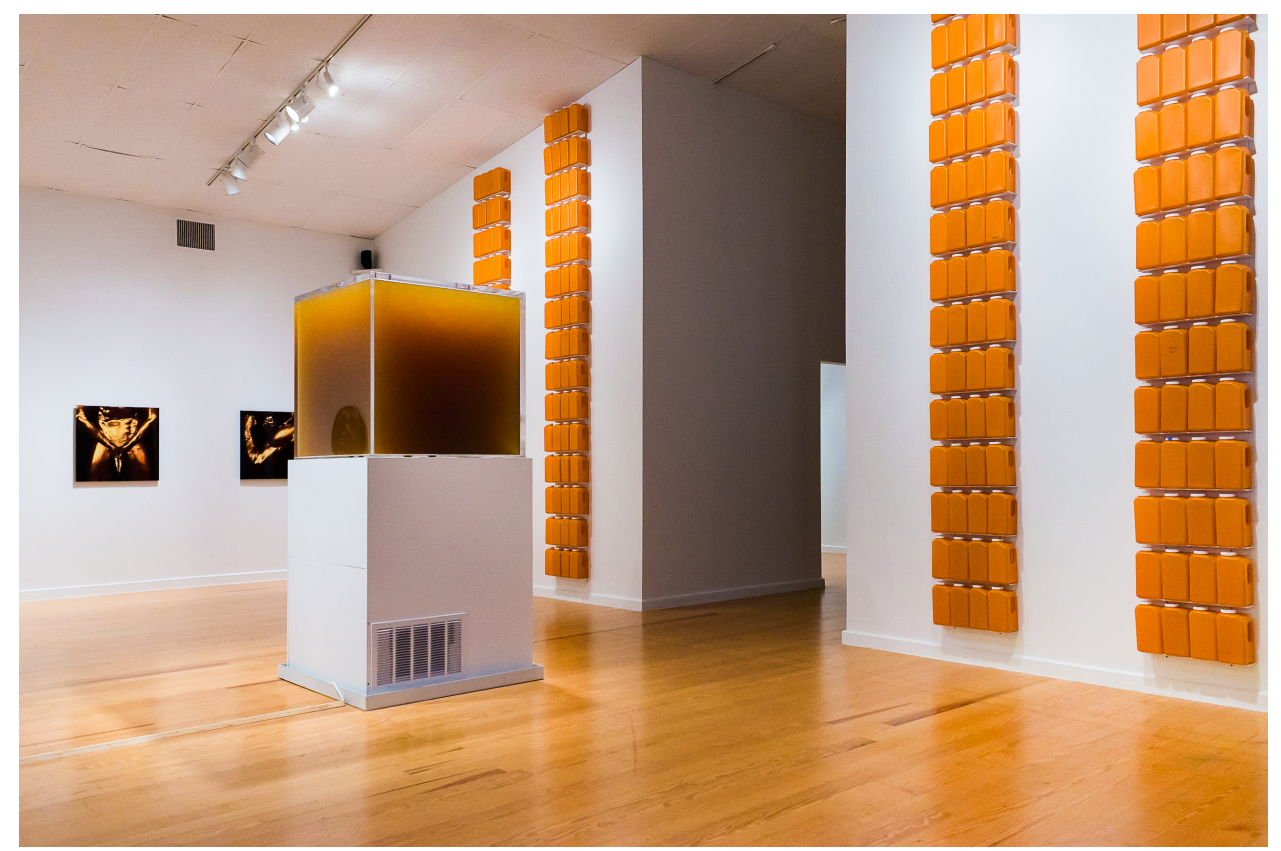
Cassils, Pissed, Station Museum, 2018.

With "PISSED" I learned a lot, for instance how urine is weaponized by the state when it considers trans people's pee to be a potential criminal offense. But also, in shipping urine, I had to take precautions because it was considered a biohazard. I am trained as a painter and retain this love of materials. I was trying so hard to figure out how to sustain the material of urine, but it is ephemeral in its form. Already it is darkening in the cube as the proteins unravel and bacteria growth clouds the liquid. As a performer I know you can't ever catch a live performance entirely either. I'm teasing out this red thread through both performance and seemingly materially solid artworks, of how a complete capture of its experience, or fixing it for eternity, is impossible. (I play on this impossibility with the breaths encapsulated in glass, included in the Monument show.) The cube of urine is contextualized by audio recordings from the Virginia School Board hearings of the young transgender man Gavin Grimm's plea to use the toilet of his choice at his high school and the ensuing proceedings of the Fourth Court of Appeals. These voices on the soundtrack articulate the ignorance and biases that run through every level of judicial proceedings about trans bodies and the right to public facilities. In support of Gavin Grimm and all the others his case represents, my response is to ask, "Whose lives are deemed worthy and whose do you flush?"