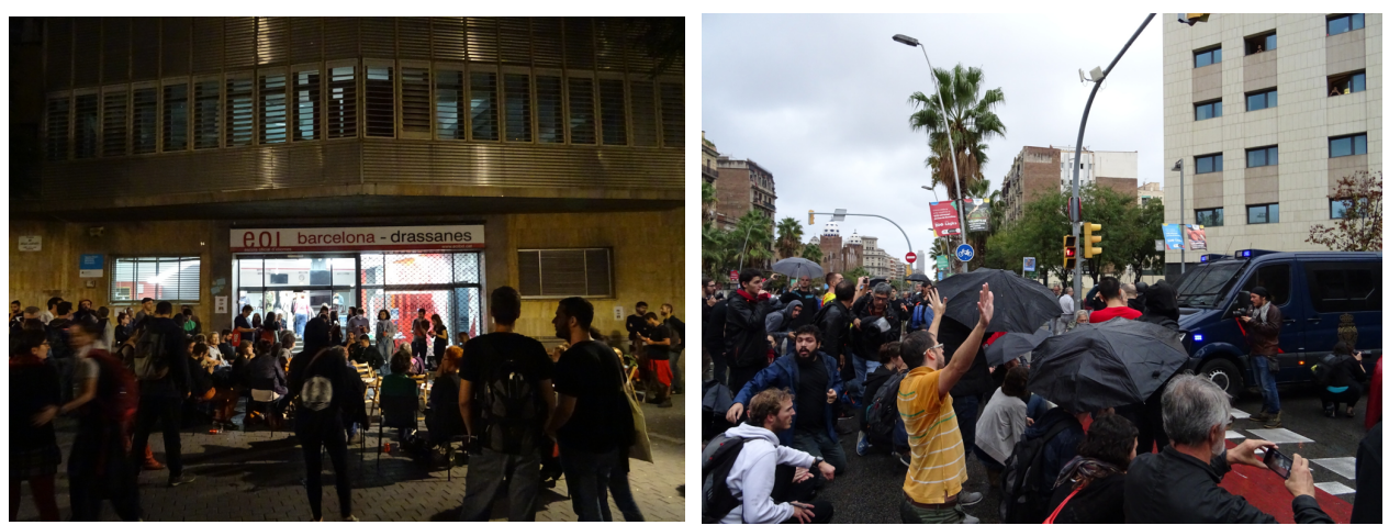
Photographs of residents at two voting centres in Barcelona.