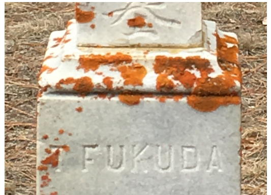
Figure 8: Grave #1, Cranbrook, BC.

Being familiar with the modern, "invented" tradition of Japan and its patriarchal family system, I automatically expect an unmarried woman to be buried together with her father's family or a married woman with her husband's. Either way, one would normally see only one last name in a family section, because children always inherit their father's name and the last names of all incoming women are converted to their husbands' family names upon marriage.