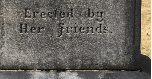
Figure 12: Grave #5, Nelson, BC

According to the burial index, Japanese people who died in Nelson in the early twentieth century were all buried without being cremated—the standard practice in Japan today. The index indicates cases of cremation from more recent years, and I wonder if crematory services were not available back then or if these people chose burial over cremation. I did some quick research and learned that cremation was not