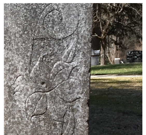
Figure 11: Grave #4, Nelson, BC.

This grave was found in General Section #2, but unlisted in the index. The inscription of this grave reads: "Japanese, Chika Noguchi; Born in Shizuoka-Ken, Japan; Died Oct. 30, 1904; Aged 24 Yrs."