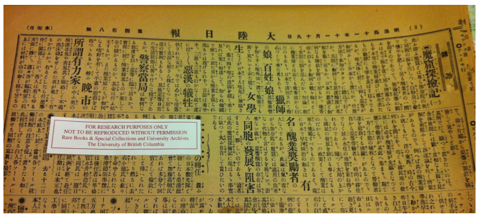
Figure 3: "Exploration of Devil Caves (1)," Tairiku Nippo , November 19, 1908, p.5.

But I am mainly interested in him because he was the author of "Exploration of Devil Caves," a newspaper column series published over seventy-one installments between 1908 and 1909, and which was followed up by a second part consisting of thirty-two installments in 1912. The series presents an elaborated account of the lives of Japanese men and women involved in the sex trade in Canada at the turn of the twentieth century. Osada's intention in