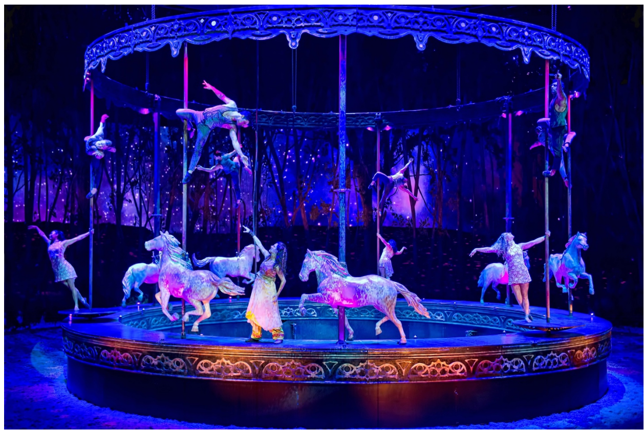
Odysseo's Carousel Act.

Still, one has to acknowledge that Odysso has made some progress with regard to gender equality, as has society at large. No woman seems to be in need of male help to mount her horse. Women also participate in previously male-dominated horse riding skills such as Cossack riding. However, this does not mean that female sexuality is completely vacant of hints of animality, or that the horse is not feminized. In one of the last scenes of the show, female performers promenade alongside the slow plod of their neighing partners. The scene is telling because the horses' manes uncannily resemble the hairstyle of their female companions. The coiffure of both, horse and woman, shows how femininity is still in close relation to animality, but also how the horse is feminized, being subjected to Western beauty standards.<sup>6</sup>