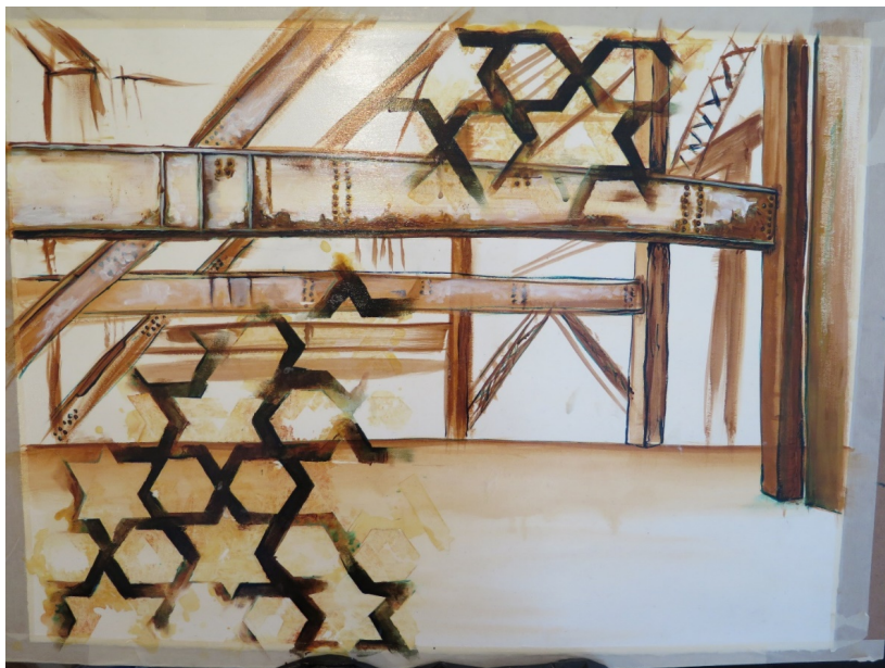
Situation Rooms painting, layer 2.