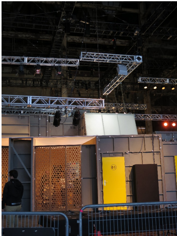
The Situation Rooms at the Hearn.

Against the rough and worn textures of the set exterior and the Hearn's architectural ruin, the yellow doors of Situation Rooms contrasted sharply with this surface. The hue was warm and saturated, with a glossy finish that seemed fresh and untouched by time and travel. These doors were tantalizing but solidly refused access to the interior spaces that are hinted at through the wooden screens and window portals. Only the chosen were allowed entry. The chosen included the twenty participants who bought tickets to the performance event. The Situation Rooms narrative requires that each run includes exactly this number, since there are moments where stories intersect and produce some interactivity between spectators. To ensure a full run, rush tickets were used to fill any no-show gaps, and failing that, one of the volunteer staff would step into the role of spectator. Although there were twenty possible narratives, each spectator only rotated through a sequence of ten, depending on which tablet they picked up at the start of the event. Most of these stories were also experienced by several other spectators, but the order and timing differed so that participants were arranged and guided smoothly through the space without colliding.