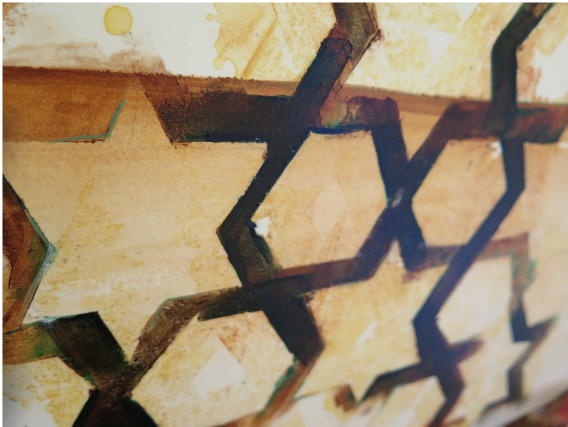
Close-up of Situation Rooms painting.