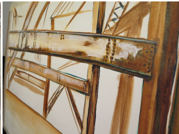
Situation Rooms painting, layer I.

From the exterior, the set-space of Situation Rooms looked ad-hoc, resonating with the industrial surroundings in the Hearn. Plywood beams and sheets were painted gunmetal grey, with their unfinished texture facing outward to reveal wall joints, piping, electrical work, and further construction necessities. Other sections of the set revealed some of the interior set-space materials, like the geometric screening from a middle-eastern themed room, a corrugated iron rooftop, shabby window draperies, and a modern cityscape projected onto a fabric wall. These surface textures stratified, stacking one story onto another, and creating the illusion of a haphazard shanty-town that had organically developed out of these materials.