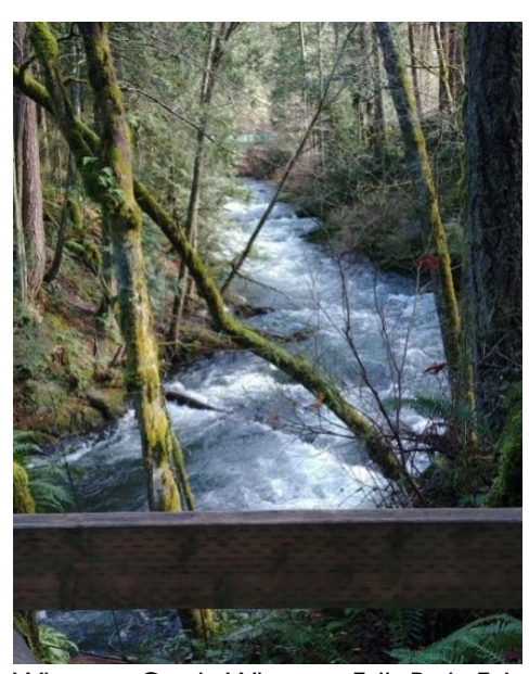
Whatcom Creek, Whatcom Falls Park, February 17, 2021.