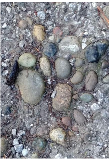
Close-up of the constellation of rocks, stones, and pine needles on the path into Whatcom Falls Park, February 17, 2021.