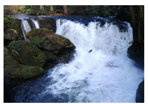
The falls, Whatcom Falls Park, February 17, 2021.