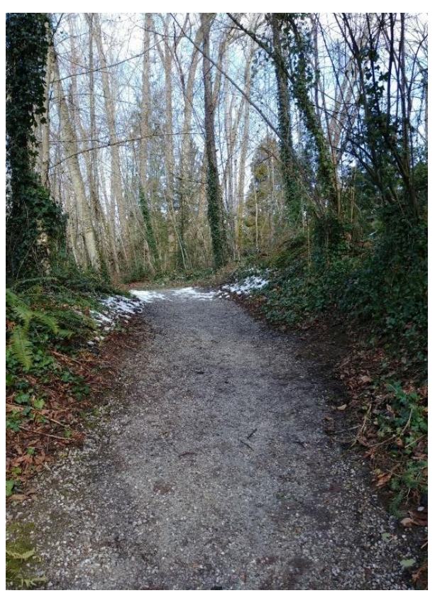
The path into Whatcom Falls Park, February 17, 2021.

1. Impermanence: "Guesting is by nature impermanent," writes Hughes. "Guests are not resident owners. They come to a place already occupied, already owned. They come to a specific place, a place that existed prior to their arrival and prior to their needs as guests" (Hughes 2019, E-24). Escaping the roar of traffic on Lakeway Drive, the main road intersecting with the south entrance to the park, I begin my ascent up the gravel path to Whatcom Falls Park. I begin to tune my ear to the sound of the wind in the trees and the crunch of gravel under my feet as I walk in a moderate but steady rhythm. I think about the rocks that have occupied the earth for billions of years. They precede me and will proceed after me. I am impermanent, a mere snapshot in their time.