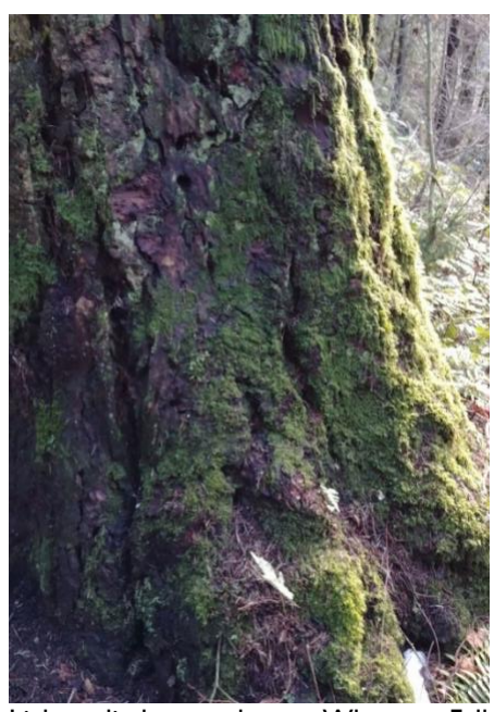
Lichen climbs an oak tree, Whatcom Falls Park, February 17, 2021.

3. Relationship: "Dependency requires relationship. One is always the guest of someone, of someone who is real and alive" (Hughes 2019, E-24). I pass by a large oak tree. Its trunk is climbing with lichen. What does it mean to be the guest of slow-growing lichen? To dance with a tree in a pas de deux-like exchange of carbon and oxygen? Thinking through relational movement, Erin Manning writes, "Movement is one with the world, not body/world, but body-worlding. We move not to populate space, not to extend it or to embody it, but to create it" (2009, 13). What does it mean to body-world with an oak tree? How do I ask a tree for consent to world together and blur the boundary between human and nonhuman, where this dissolution is a practice that takes time, and that doesn't occur perfectly in the first instance, if ever?