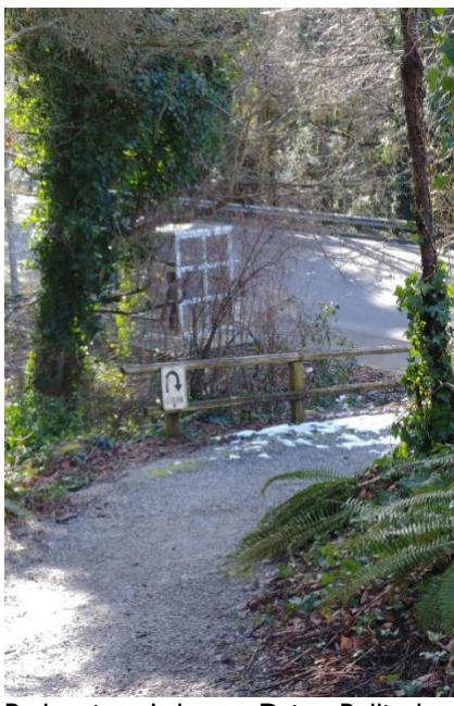
Park exit to Lakeway Drive, Bellingham, February 17, 2021.