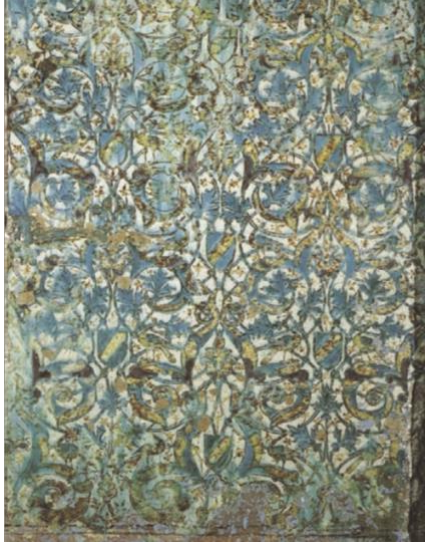
Nasrid tile, fifteenth century, glazed and painted blue and manganese earthenware with lustre, Museo Arqueológico Nacional, Madrid, 1948–31 (Bordoy 1992, 102).