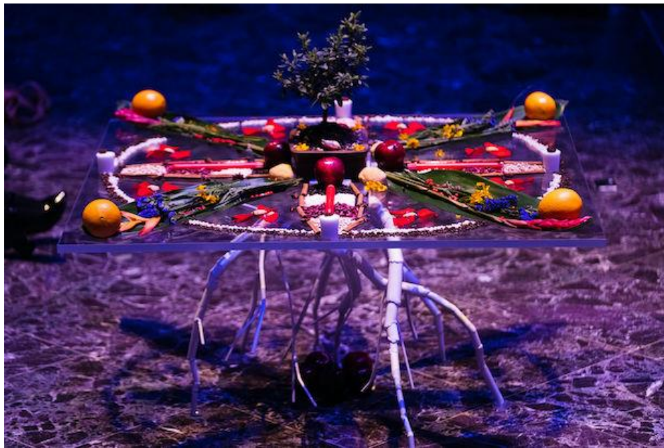
Altar in Zaccho Dance Theatre’s Love, A State of Grace. Grace Cathedral, San Francisco, CA, 2022.