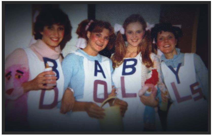
Author (second from right) and friends wearing collaborative costuming for a college party.

Early in my first semester of college I realized that I could be popular—a status I had only achieved on a small scale before, and certainly not in secular settings such as high school.