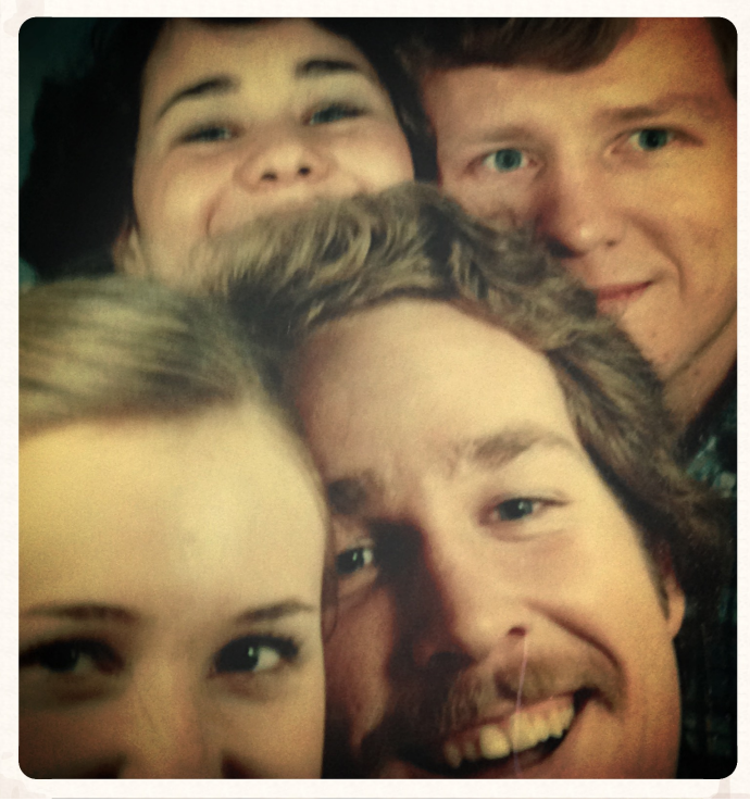
Author and friends.

It seemed to me that everyone here loved Jesus and that this was a place I could thrive. Getting to know people was quick business without all that front-end work of finding out where they stood on spiritual matters. I could achieve intimacy, or what seemed like it, instantly. I could cut to the chase in friendships and romantic relationships; I was enraptured. I took full advantage of the sense of belonging I now felt, to make friends by the score and of course, date lots of boys.