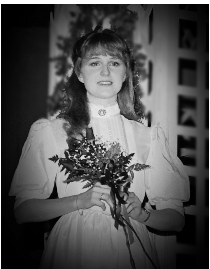
Author listening to a recording of her father's voice during coronation ceremony.

Too soon the moments passed, and it was time to announce the queen!