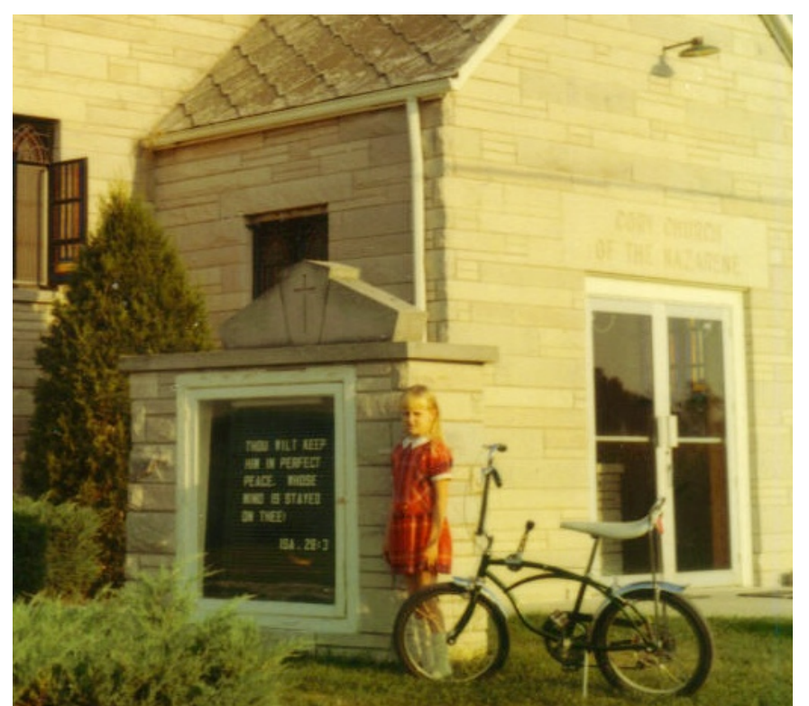
Author as a child, standing in front of a church her father pastored in southern Indiana, United States.