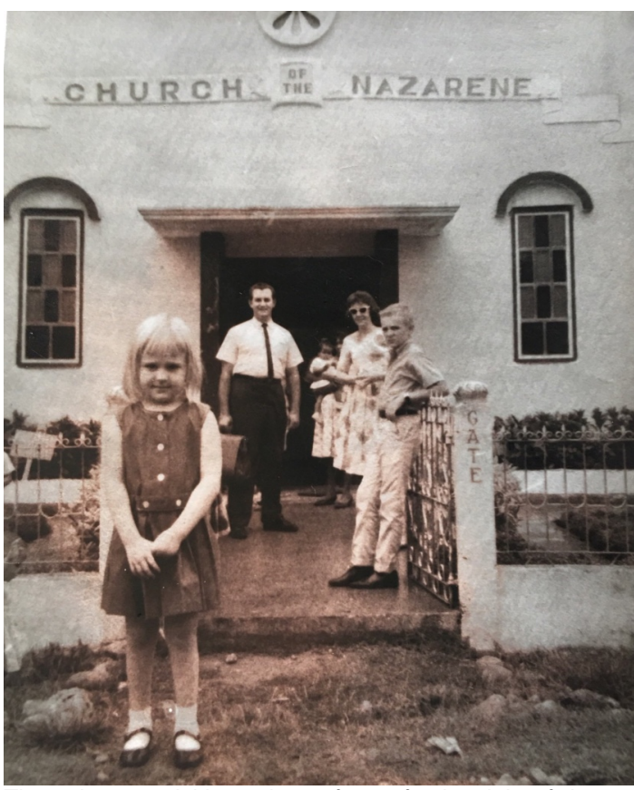
The author as a child, standing in front of a church her father pastored when he was a missionary in the Philippines. I

I finally watched Jesus Camp , the documentary about fundamentalist church camps for kids.<sup>2</sup> I heard about the movie a long time ago from friends who seemed both dismayed and disdainful even as they recommended it. My son was unambivalent. "Don't watch it, mom. It's disturbing."