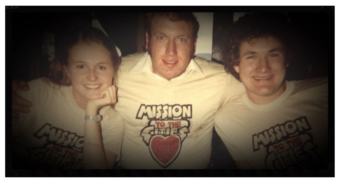
Author and friends from a church-sponsored evangelical ministry team for college students.

It seemed to me that everyone here loved Jesus and that this was a place I could thrive. Getting to know people was quick business without all that front-end work of finding out where they stood on spiritual matters. I could achieve intimacy, or what seemed like it, instantly. I could cut to the chase in friendships and romantic relationships; I was enraptured. I took full advantage of the sense of belonging I now felt, to make friends by the score and of course, date lots of boys.