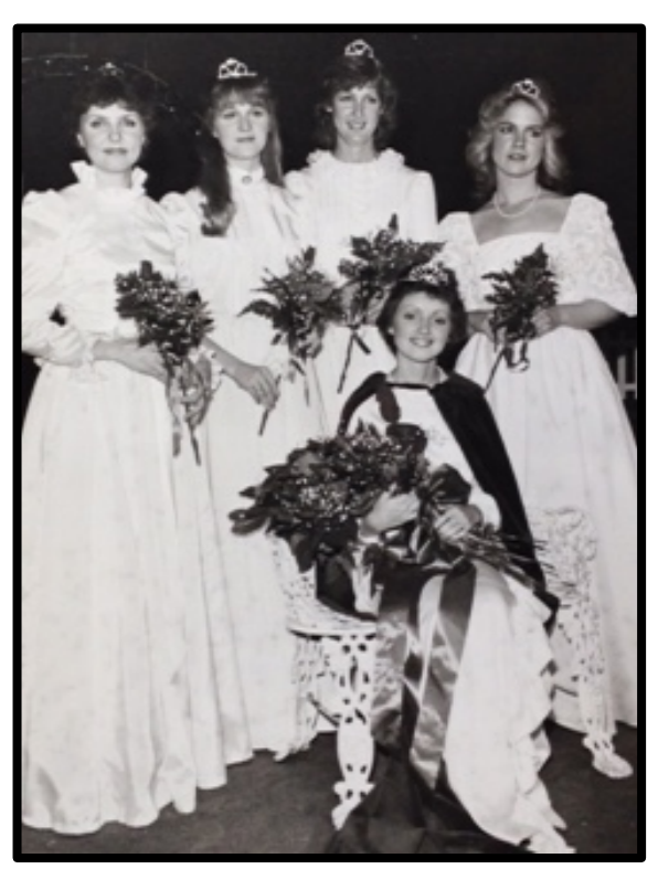
Author (second from left) and other members of the college homecoming court.

But secular didn't apply anymore, and long gone were the days of being an oddball religious freak in the eyes of schoolmates. Soon I realized—with my camp queen victory fresh in recent memory—an even more glorious prize could be mine! I had only to attend the college homecoming queen coronation to imagine that one day I too would stand in that lineup of fresh-faced young women. I too would come to represent all that was pure, gracious, and lovely in a subculture that placed undue emphasis on such traits in the ones who bore and raised its children.