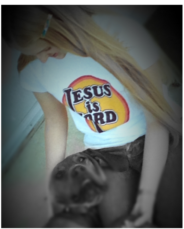
Author as a teenager wearing a "Jesus is Lord" promotional t-shirt distributed by the church denomination in which she was raised.