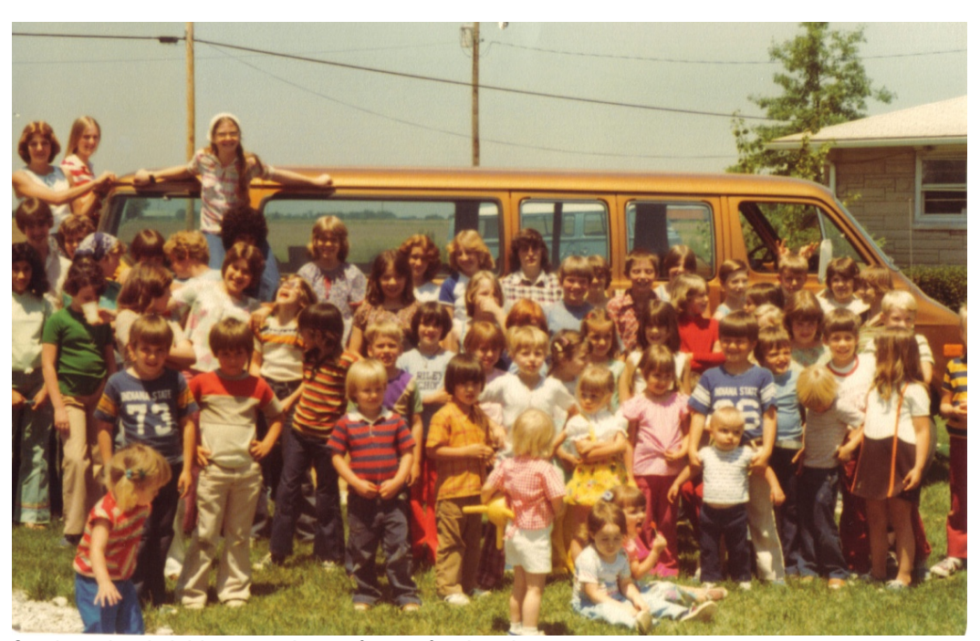
Sunday school children standing in front of a church van.

By the time I was in high school, I was a Jesus camp veteran of many years. I knew most of the other kids from southern Indiana who were raised like me, and we saw each other annually at camp as well as regional church events. I felt close to the staff who ran the camp and hoped one day to be a church leader like they were, or more likely, married to one.