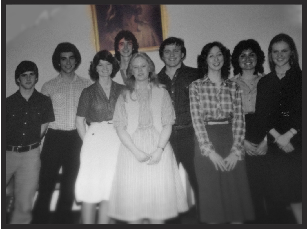
Author (far right) and other members of a college "drama ministry" team.

Church college was all that I hoped it would be. I was surrounded by people who believed like me and wanted to prepare themselves for Christ's work.